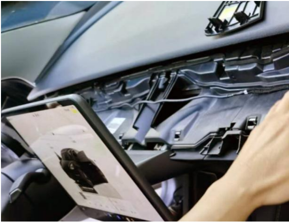
13. Route the wire under the decorative strip.