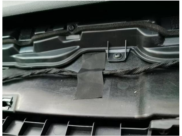
14. Secure the wire harness with black vinegar.