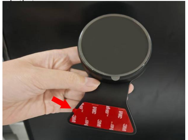
16. Remove the protective film from the 3M adhesive on the base.