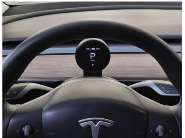
18. Turn on the instrument and check that it displays normally. Then reinstall the cover plate.