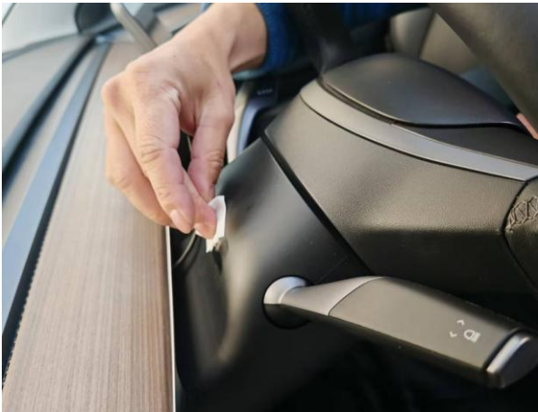
15. Use the alcohol pad to wipe off the dust on the steering column.